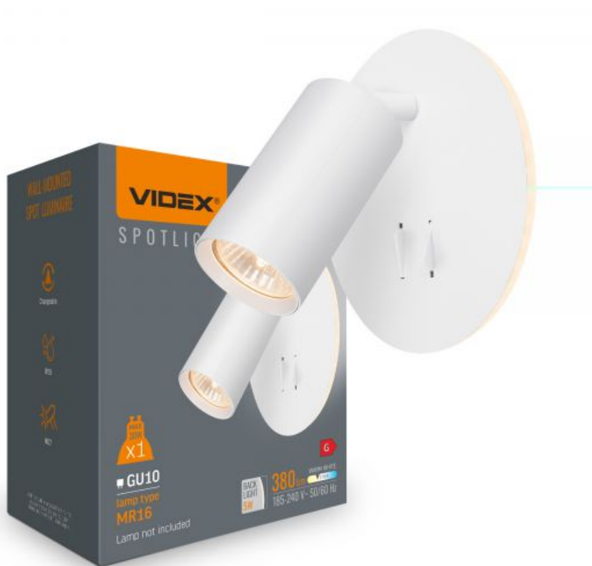
Wall-mounted spot luminaire