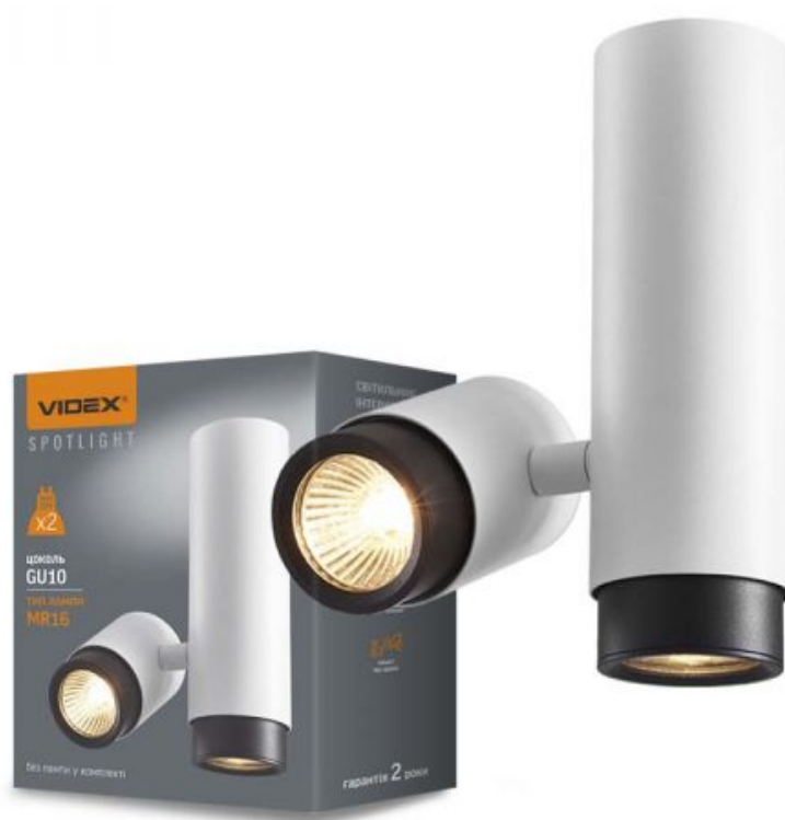
Ceiling spotlight luminaire