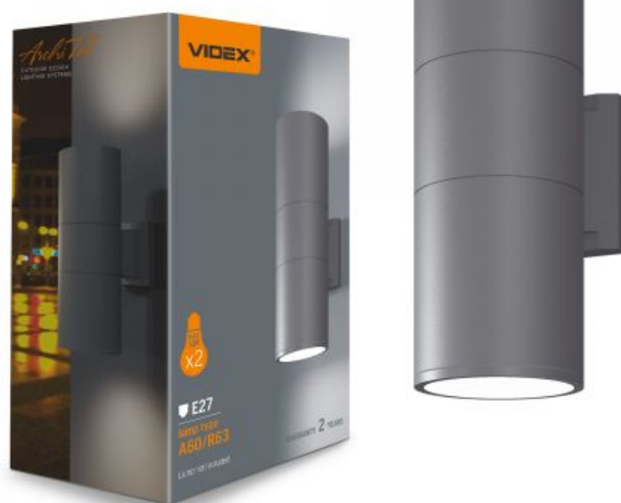
Facade double-sided luminaire