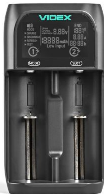
Universal Battery charger