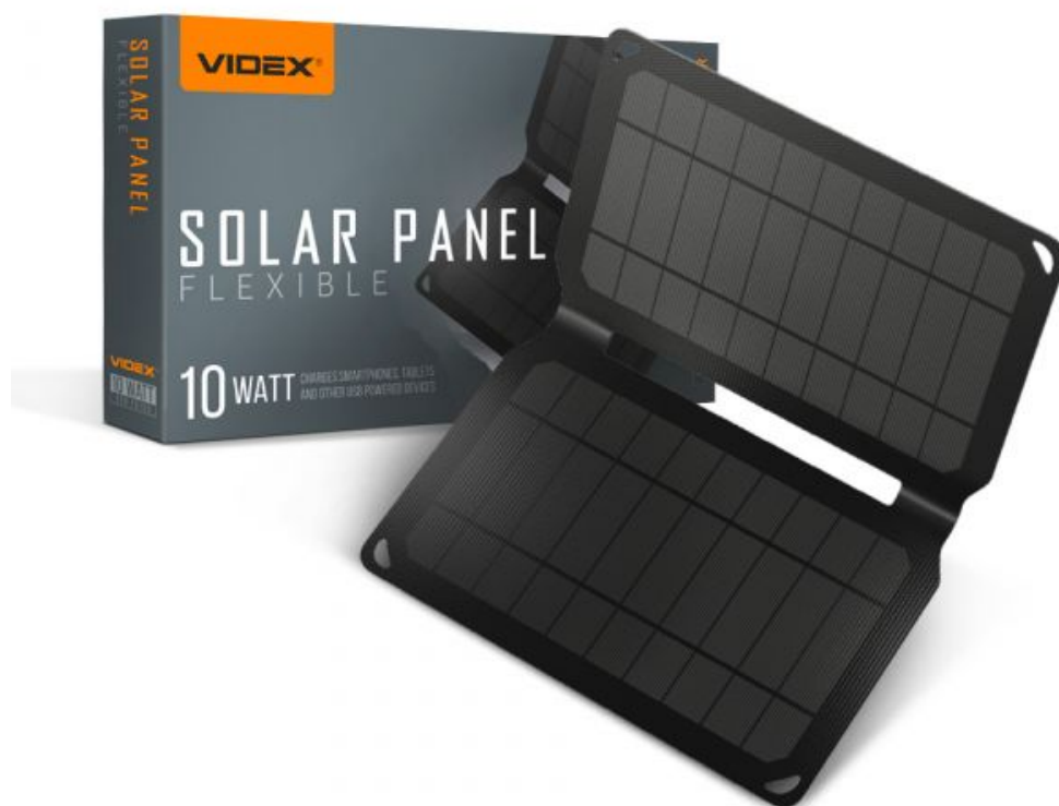
Portable solar charger