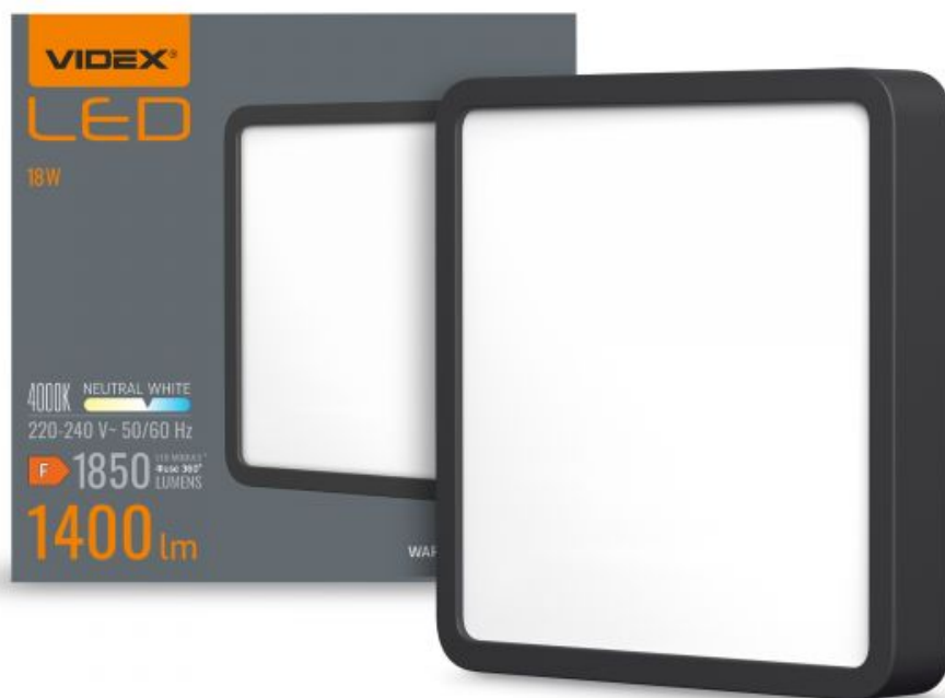
LED Surface Downlight Fixture