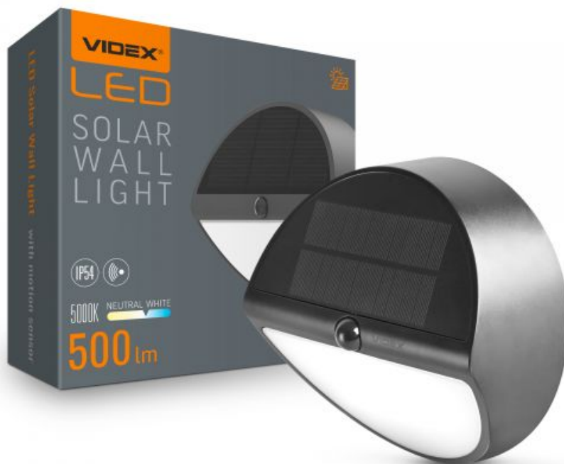
LED Solar Wall Light with motion sensor