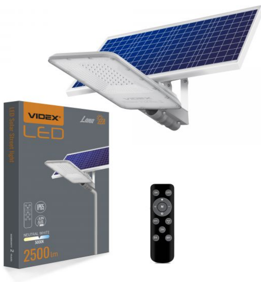
LED Solar Street light