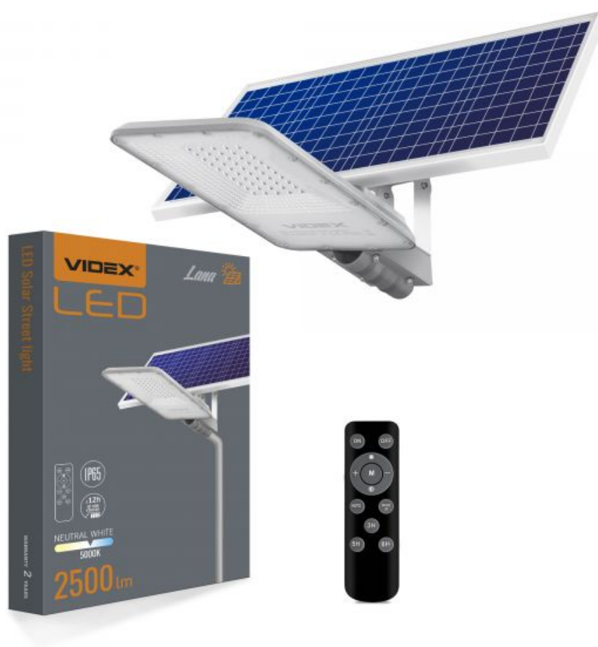
LED Solar Street light