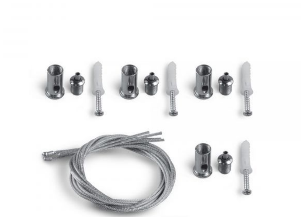
LED Panel suspension set