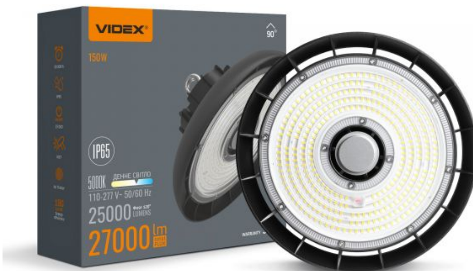
LED High Bay Light