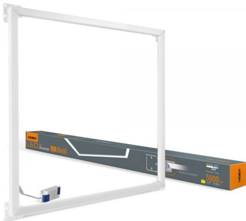
LED Frame Panel