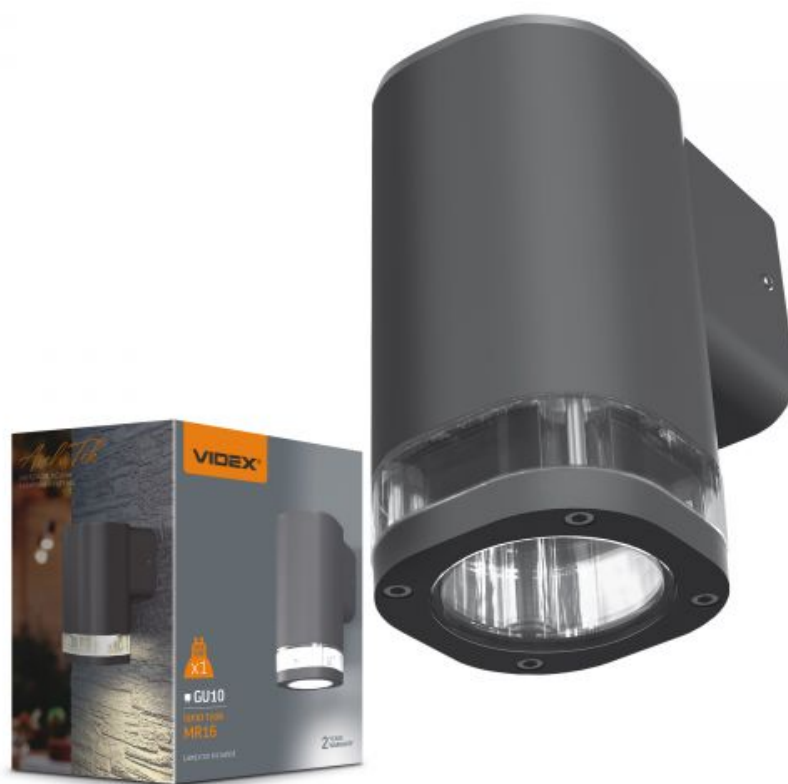
Led Fixture Architectural