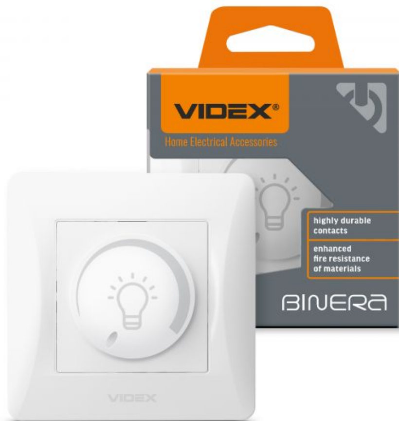
Dimmer LED 200W white