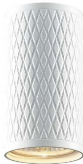
Ceiling spotlight luminaire