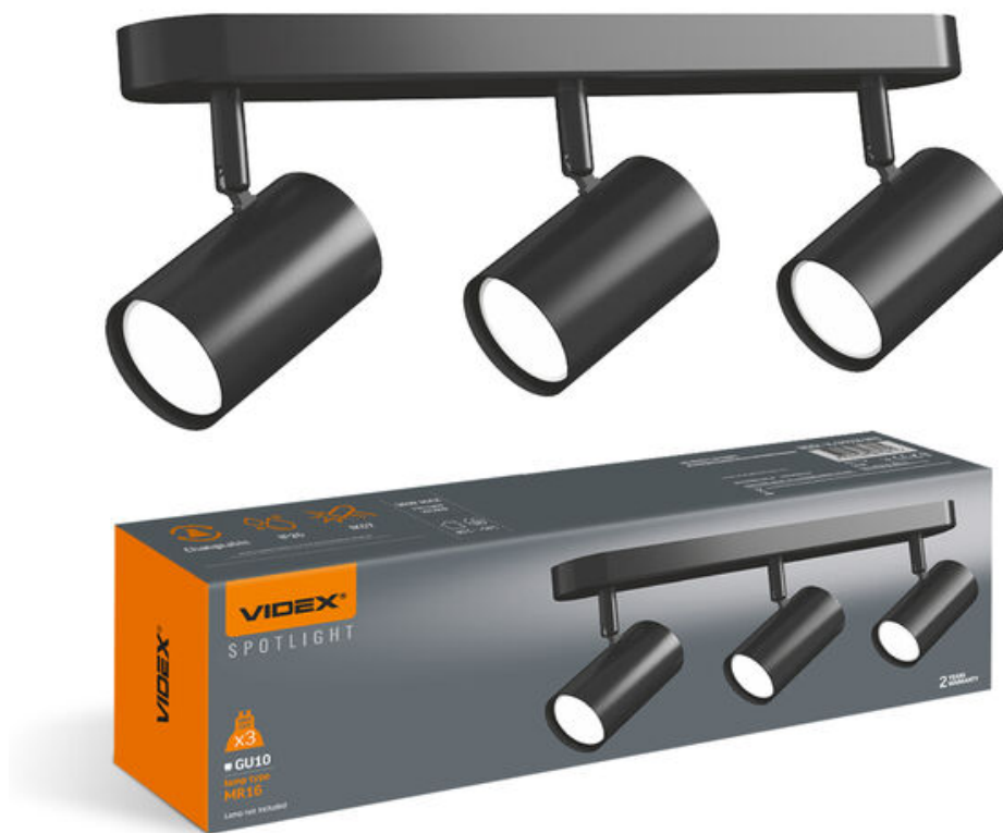
Wall and ceiling spotlight luminaire