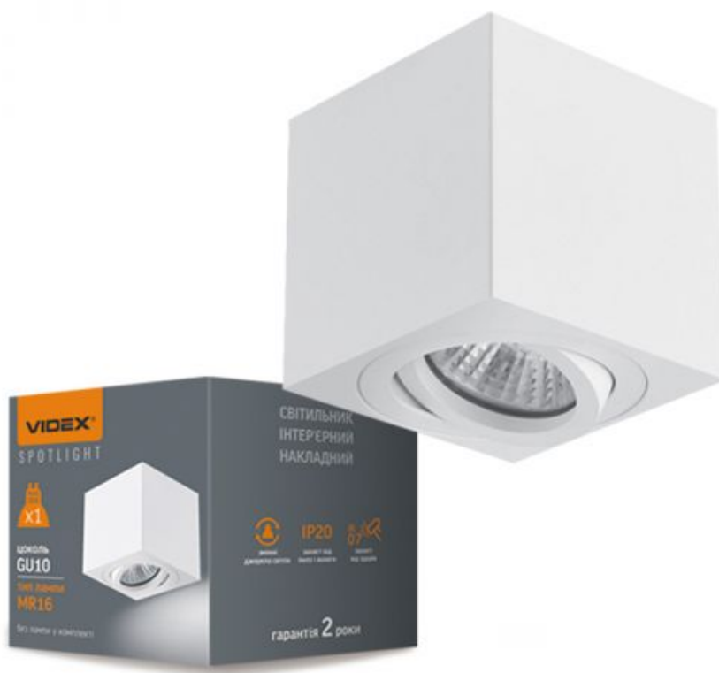
Ceiling spotlight luminaire