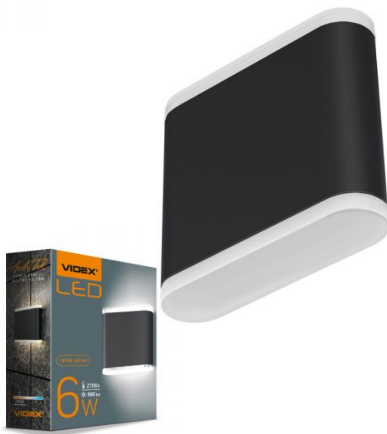
Facade double-sided luminaire