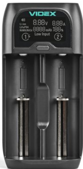
Universal Battery charger