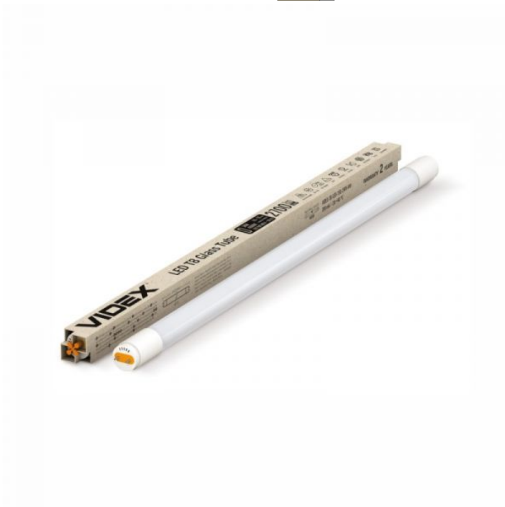
LED T8 Glass Tube