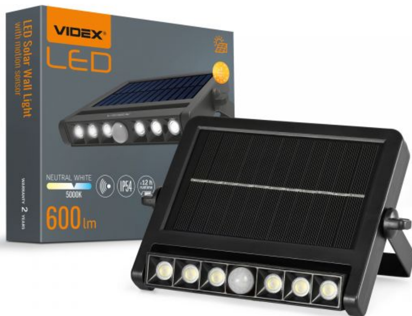
LED Solar Wall Light with motion sensor