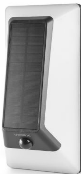
LED Solar Wall Light with motion sensor