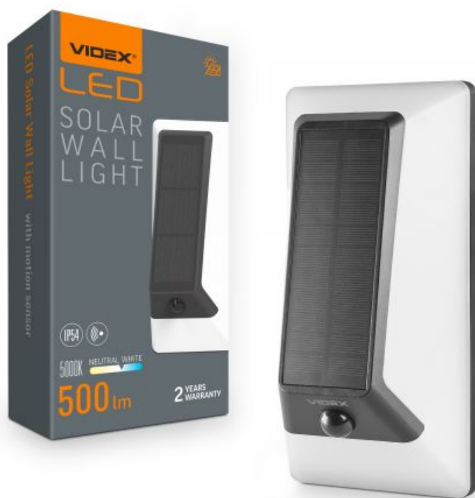
LED Solar Wall Light with motion sensor