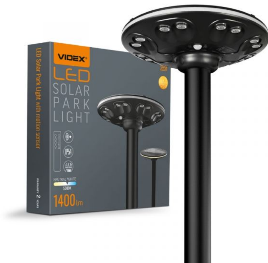
LED Solar Park Light with motion sensor