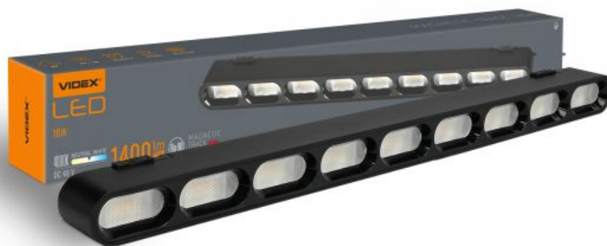
LED Light for Magnetic slim track light system