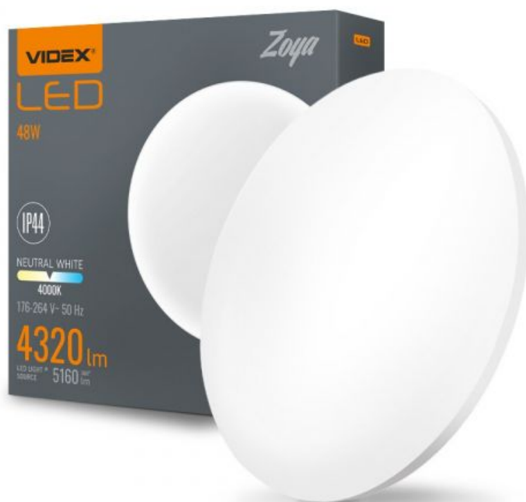
LED Ceiling Fixture