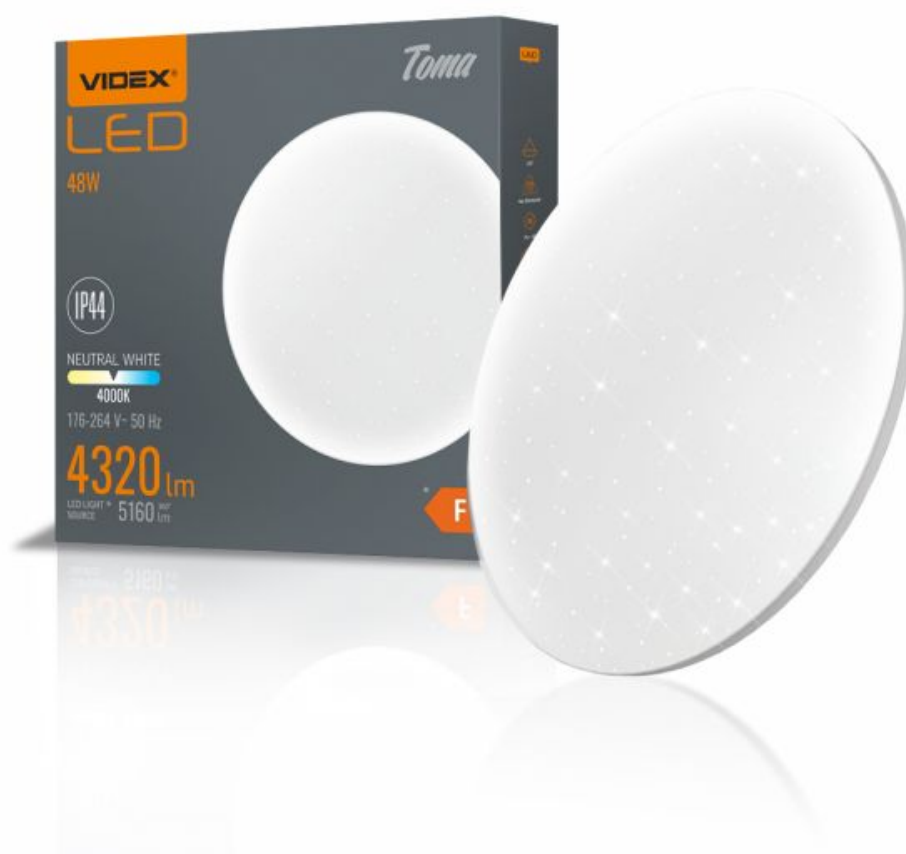
LED Ceiling Fixture