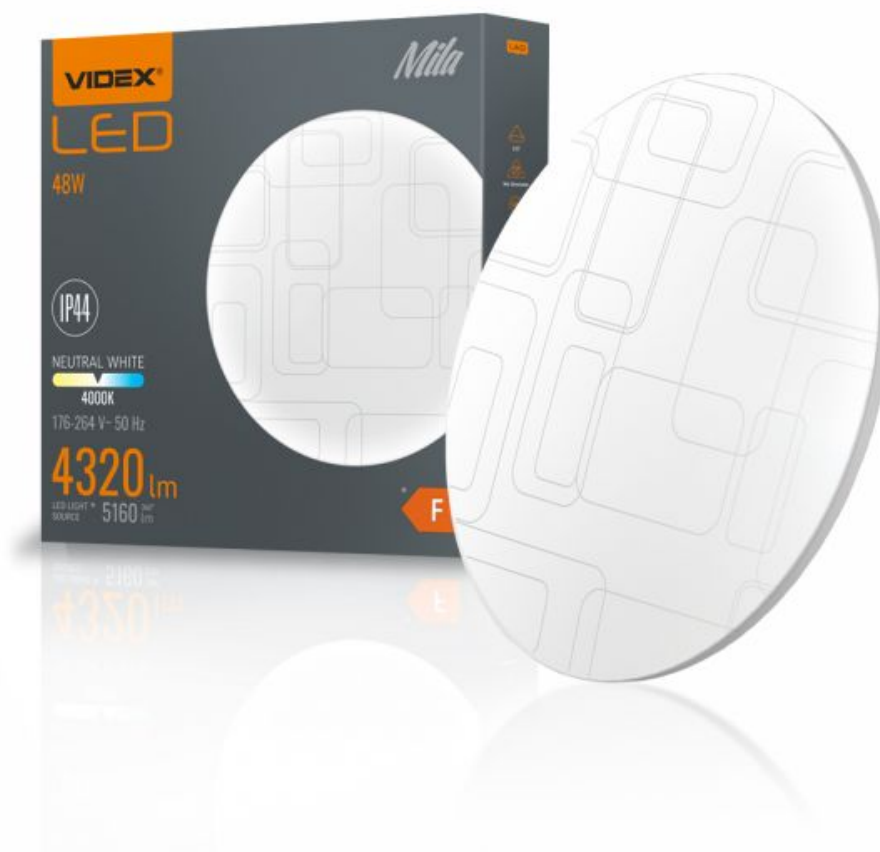
LED Ceiling Fixture