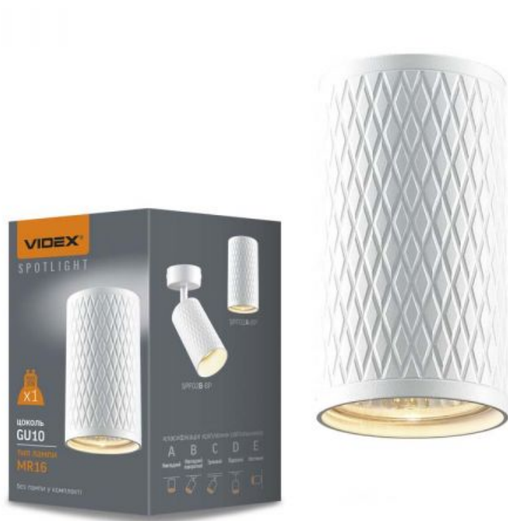
Ceiling spotlight luminaire