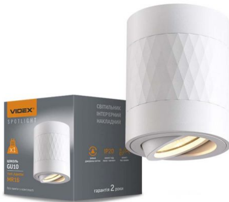
Ceiling spotlight luminaire