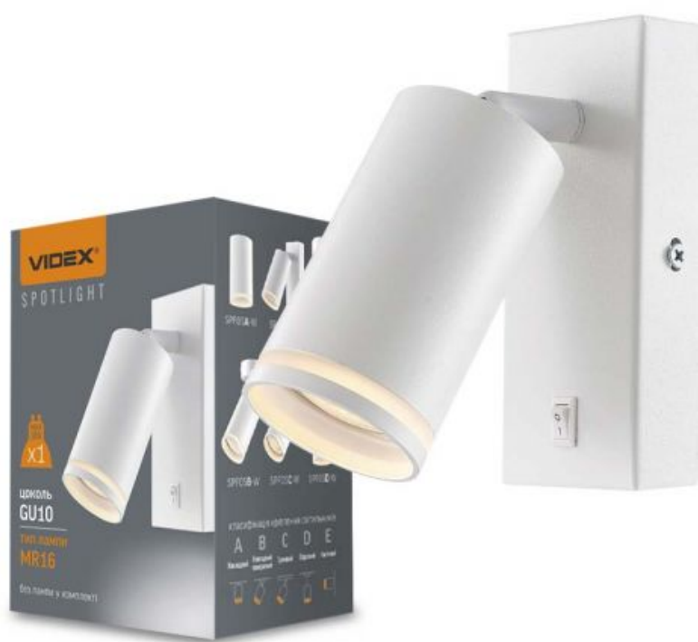
Wall-mounted spot luminaire