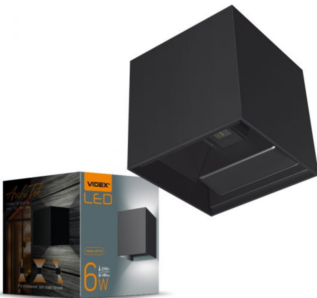
Facade double-sided luminaire