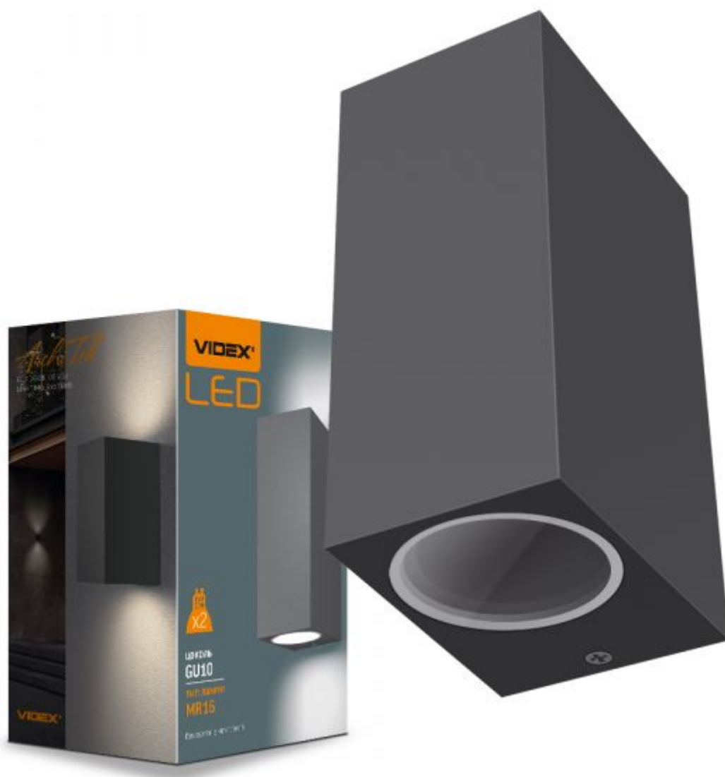
Facade double-sided luminaire