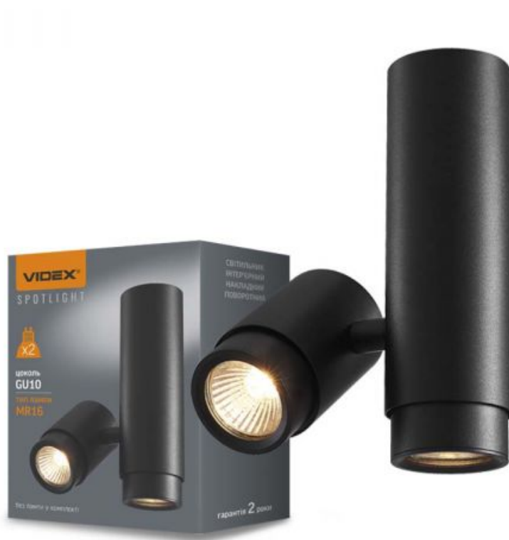
Ceiling spotlight luminaire