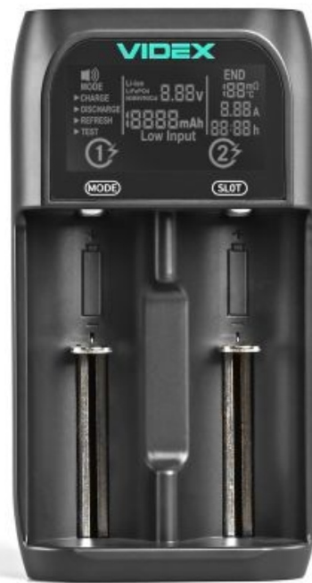
Universal Battery charger