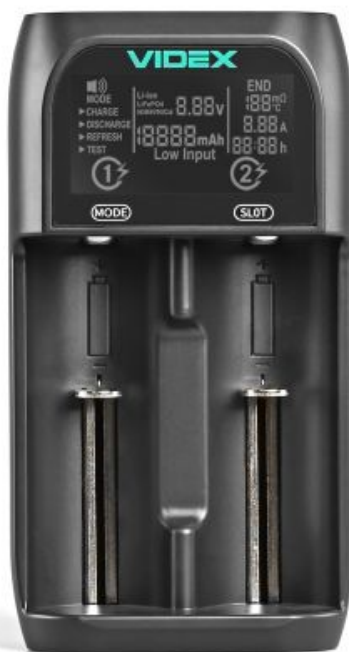
Universal Battery charger