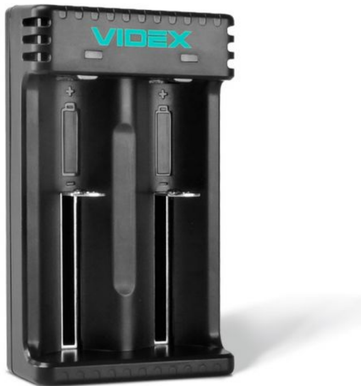
Universal Battery charger