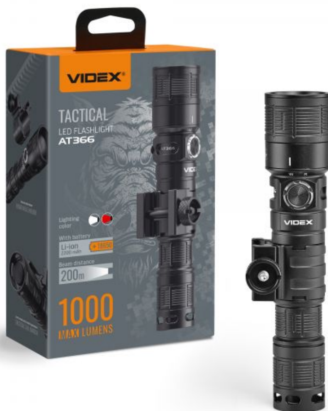
Tactical LED Flashlight