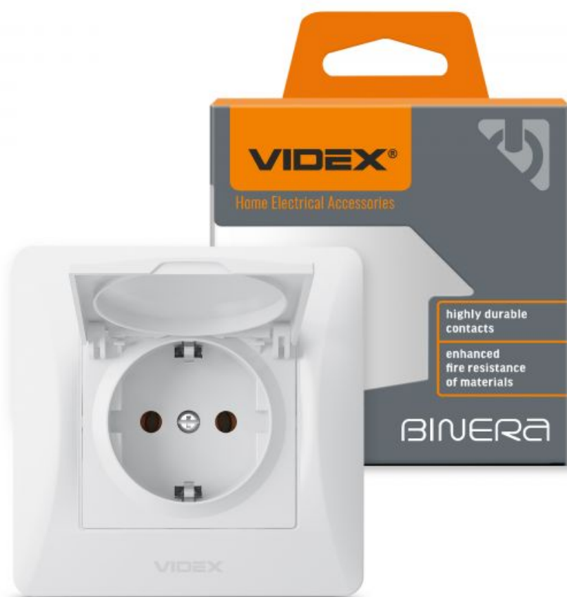
Single schuko socket with cover white