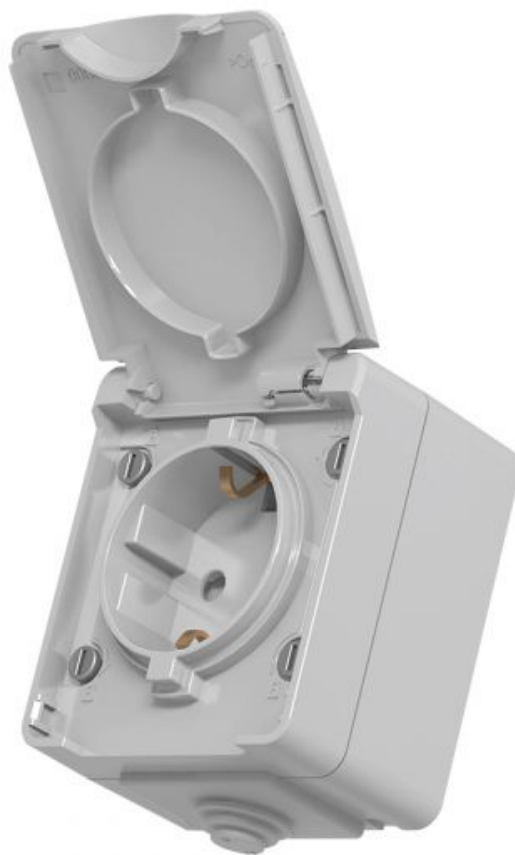
Single external Schuko socket IP65 gray