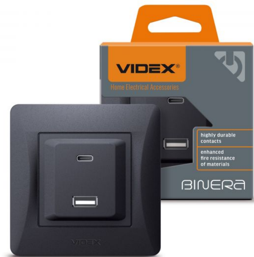
Socket USB-A + USB-C PD20W black graphite