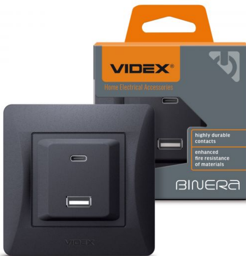
Socket USB-A + USB-C PD20W black graphite