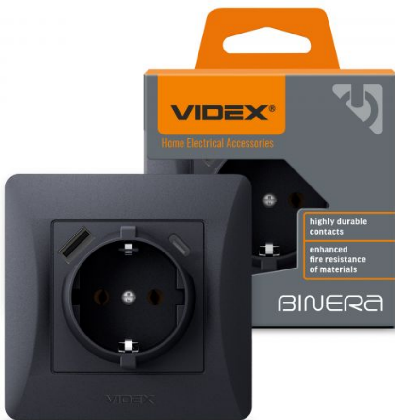
Single schuko socket with USB-A+USB-C black graphite