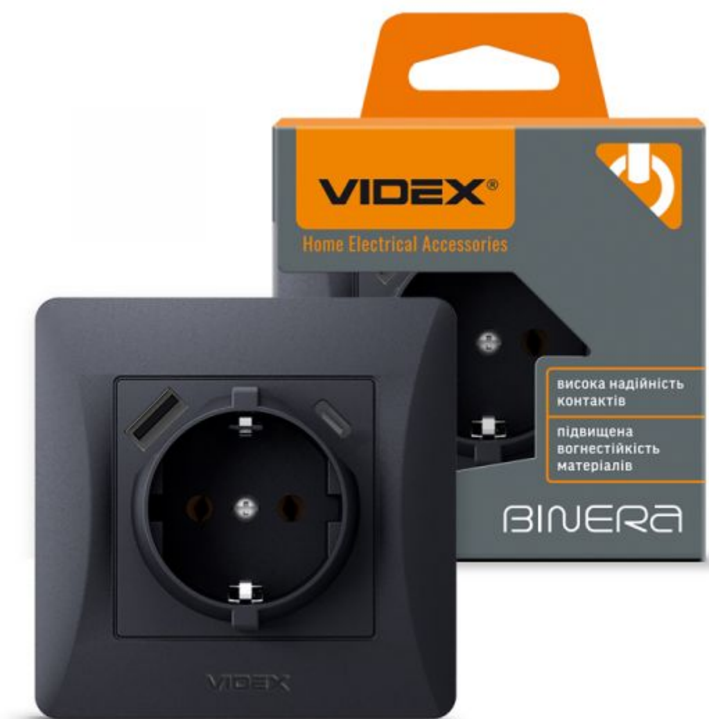
Single schuko socket with grounding with USB+USB-C black