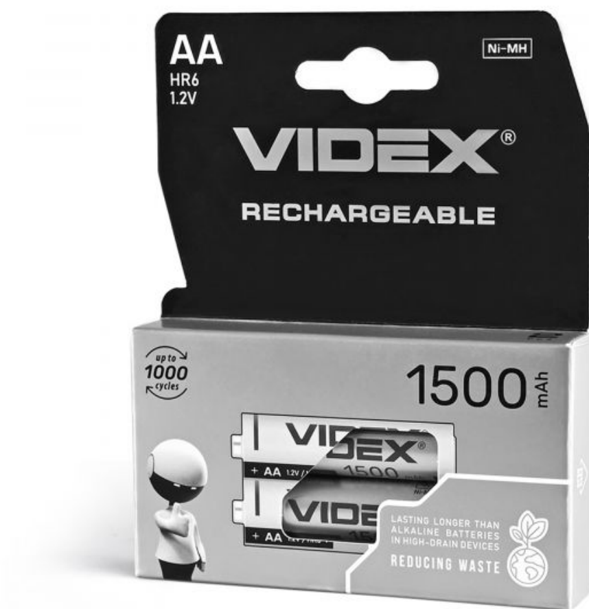
Ni-MH Rechargeable battery