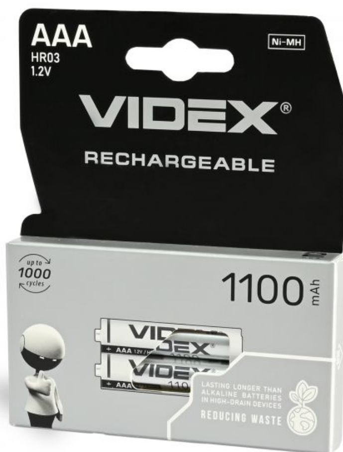
Ni-MH Rechargeable battery