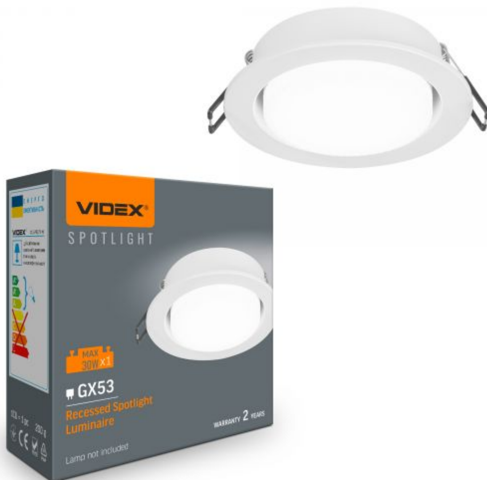
Recessed spotlight luminaire