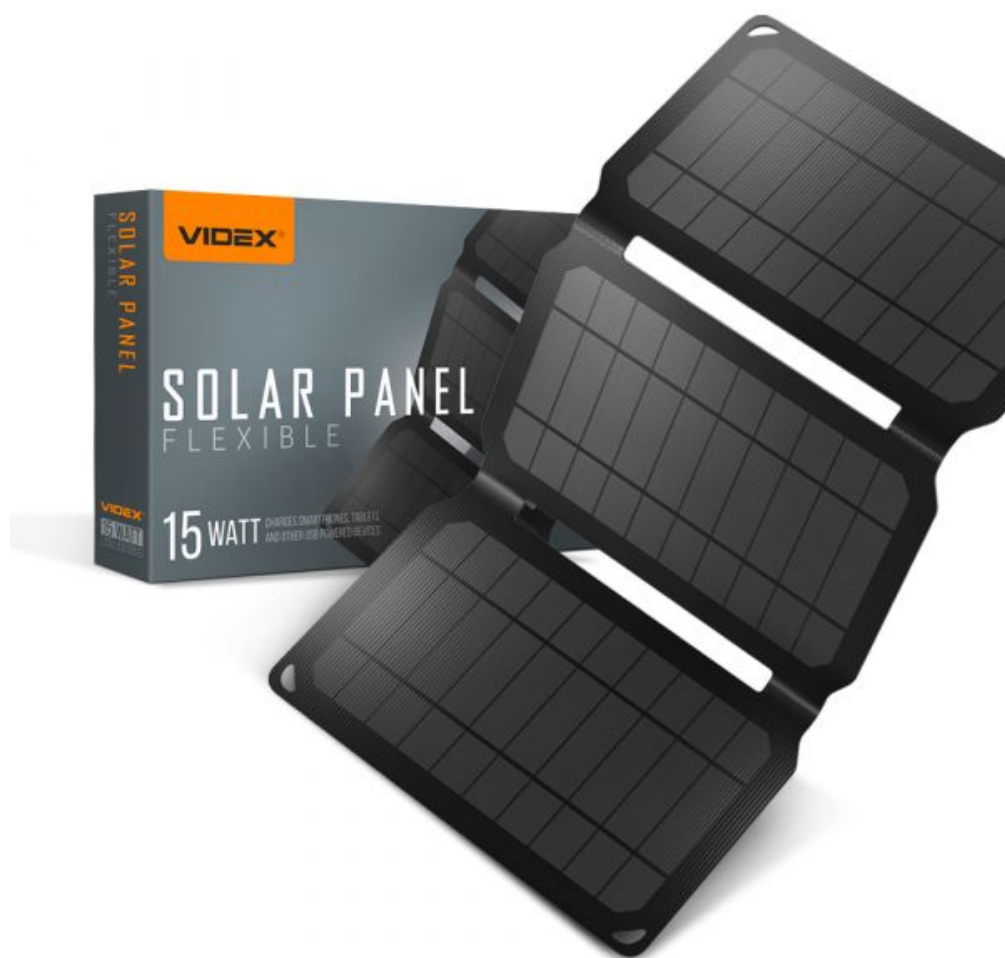
Portable solar charger