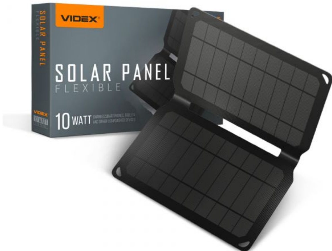
Portable solar charger