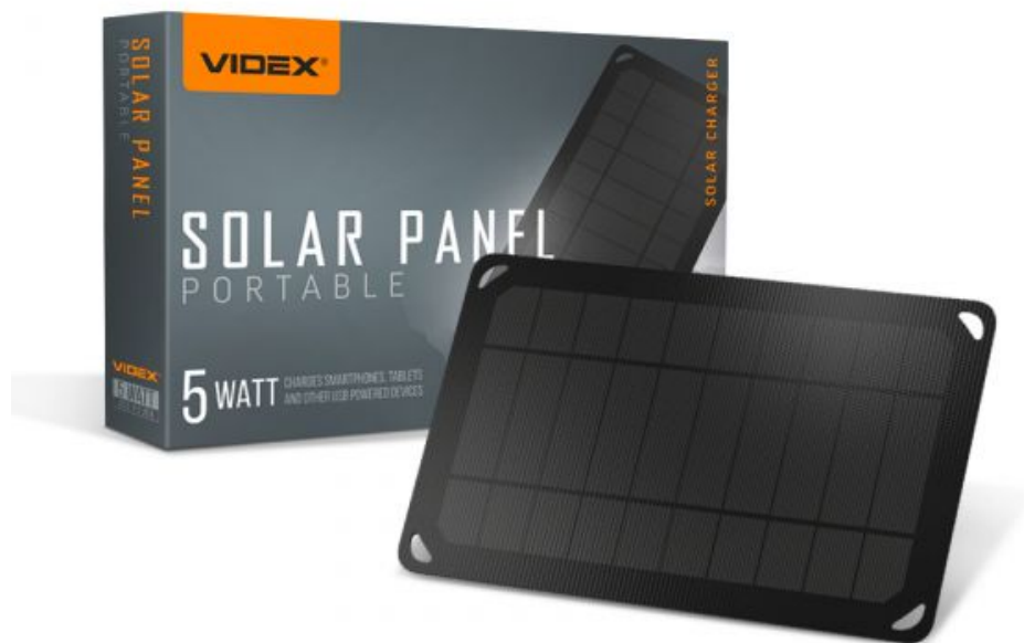
Portable solar charger