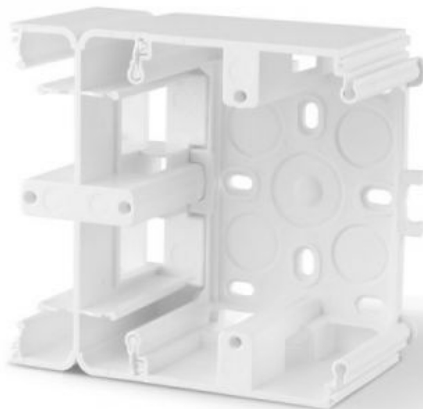
Surface mounting box module white