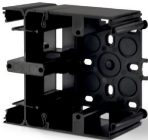
Surface mounting box module black graphite