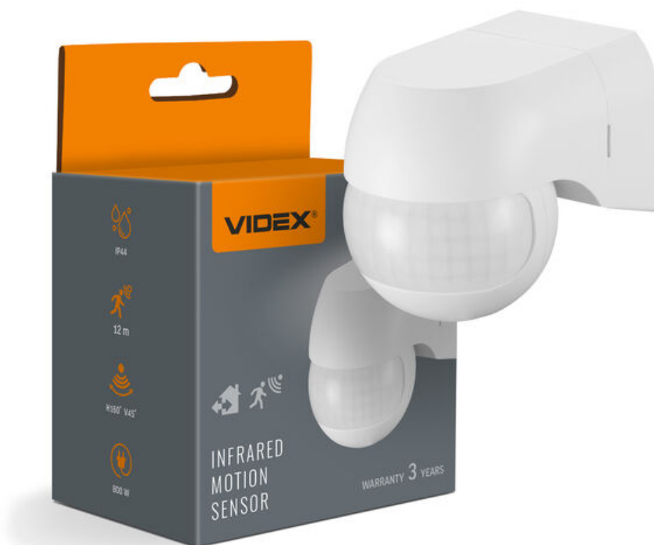
PIR motion and light sensor