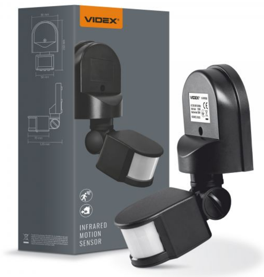
PIR motion and light sensor