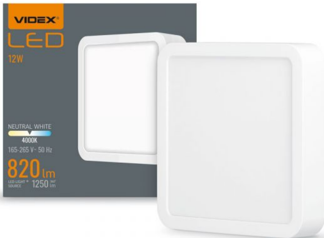
LED Surface Downlight Fixture