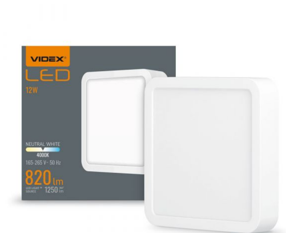
LED Surface Downlight Fixture